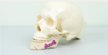
Color of implant prototype used for illustrative purposes only