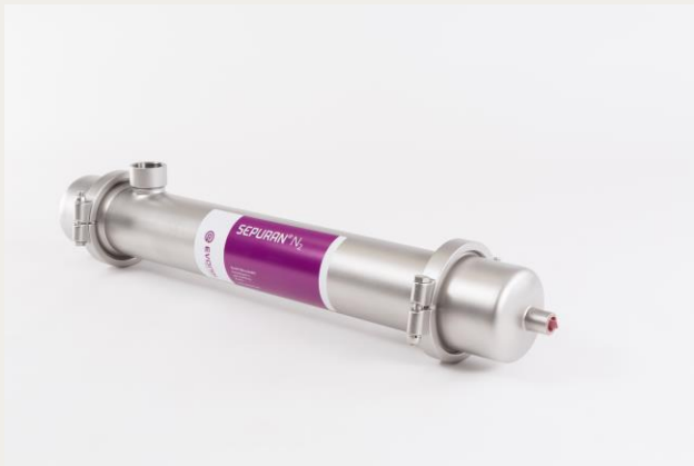
SEPURAN® N 2 module (sample picture)