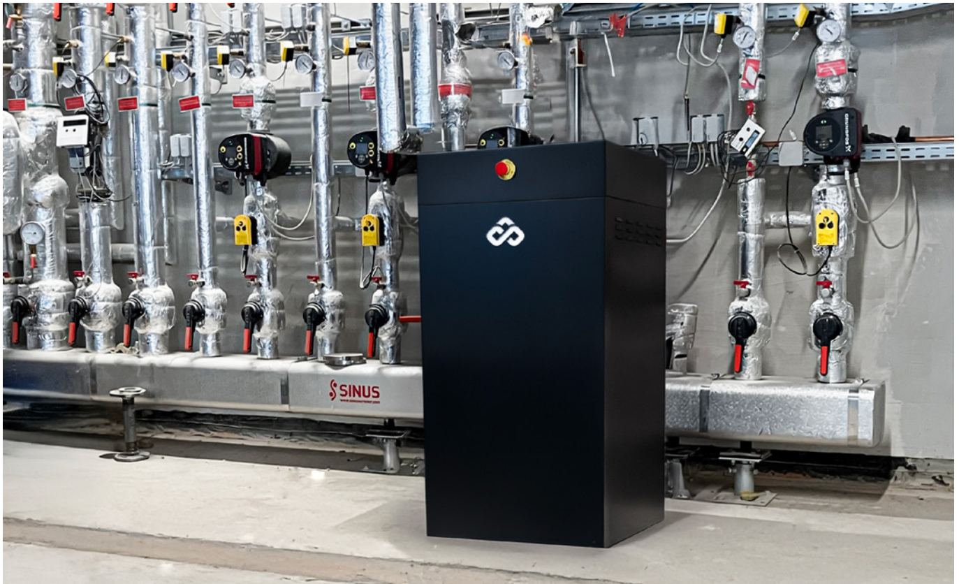
Figure 1: Proof of Concept (PoC) BiGreen-Modul at the MK Hotel Passau