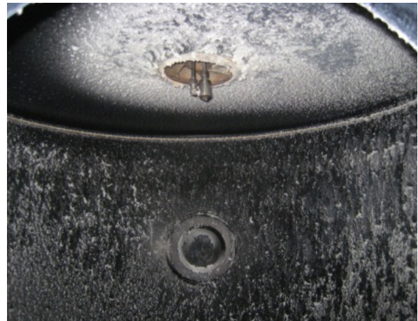
Figure 1b w/o silica