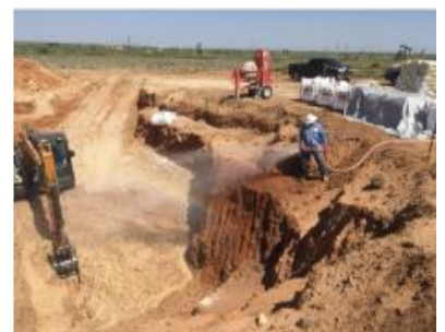
Figure 3 | Addition of Water