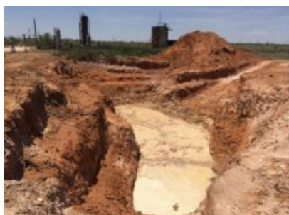
Figure 4 | Vent Excavation after Completion of Wet Mixing