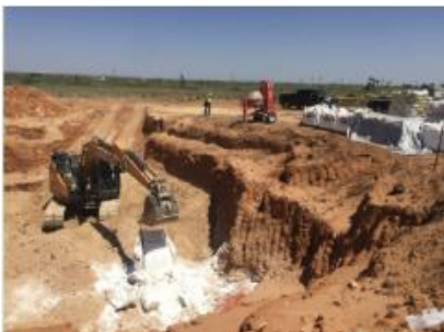
Figure 1 | Adding Dry Reagents