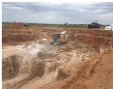
Figure 2 | Blending of Dry Reagents