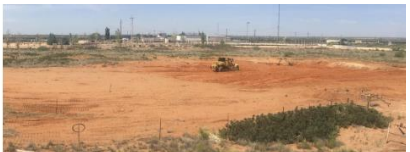
Figure 5 | Panoramic View showing near Final Backfill of both Pit and Vent Excavations