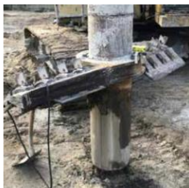
Figure 2 | Mixing head with one level of flights designed to mix the soil in situ