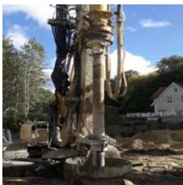
Figure 3 | Drill rig 100 ton RTG machine RS20.