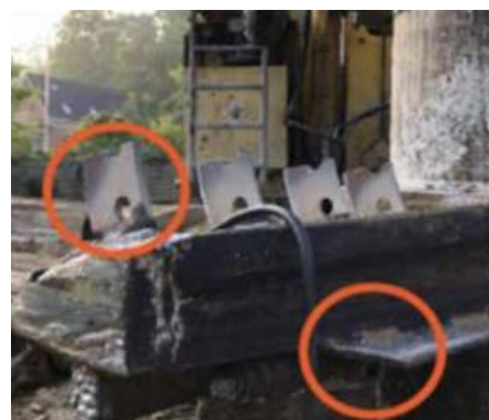
Figure 4 | Discharge capability along the auger flights to convey grout to mixing zone