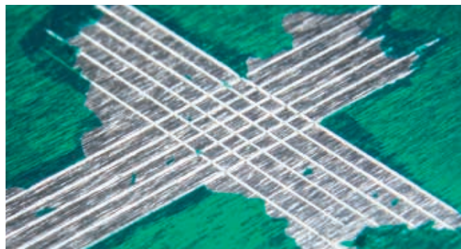
Coated without silane pre-treatment

New investigations, summarized in the table below, show that the amounts and identity of the components are of utmost importance to achieve good surface wetting properties. The wetting is also influenced by the surface properties of the substrate. The surface must be clean, free of crease and dust.