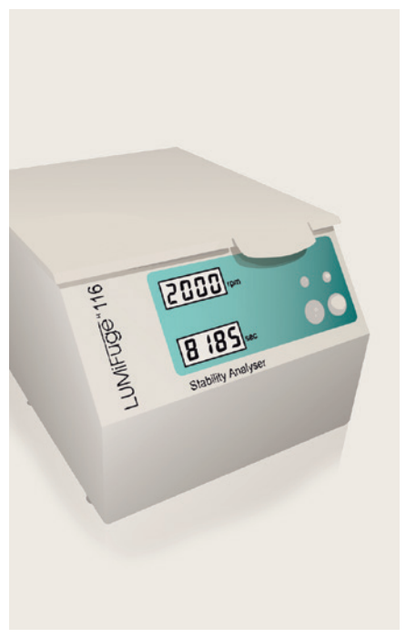
Emulsion stability analyser LUMiFuge