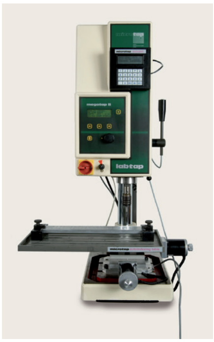
Megatap II-G 8 tapping torque equipment